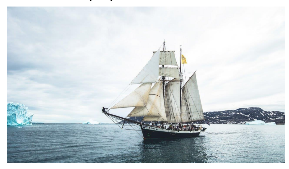
First electric propulsion in Iceland

Frequent comment - "really are you stupid "