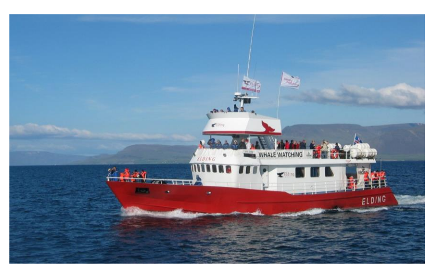
H<sub>2</sub> auxiliary system