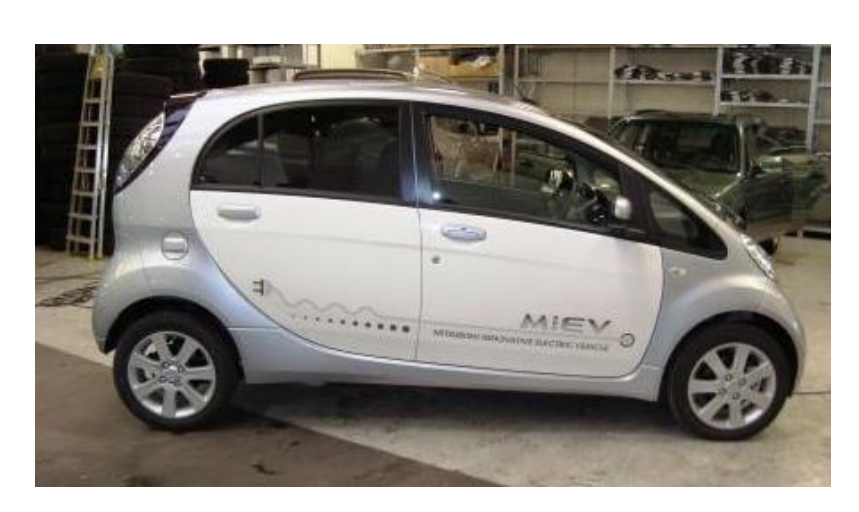
First iMiev outside of Japan