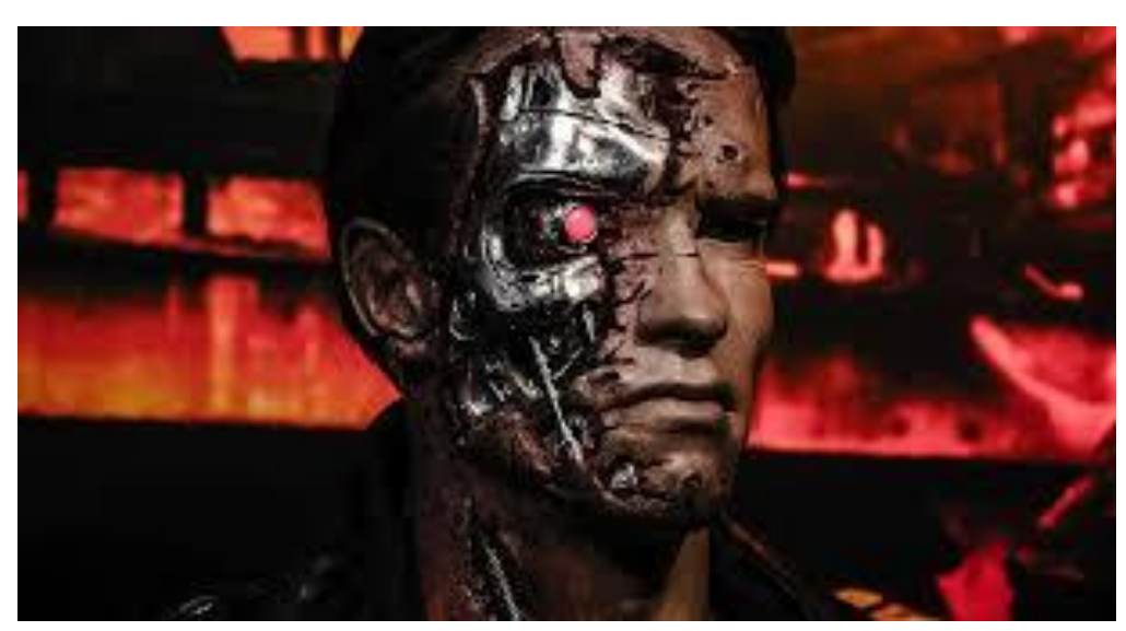
For that the owners will be remembered in history as have made a real change!

Then we are the only company in the world that the owners will celebrate when the role is terminated!