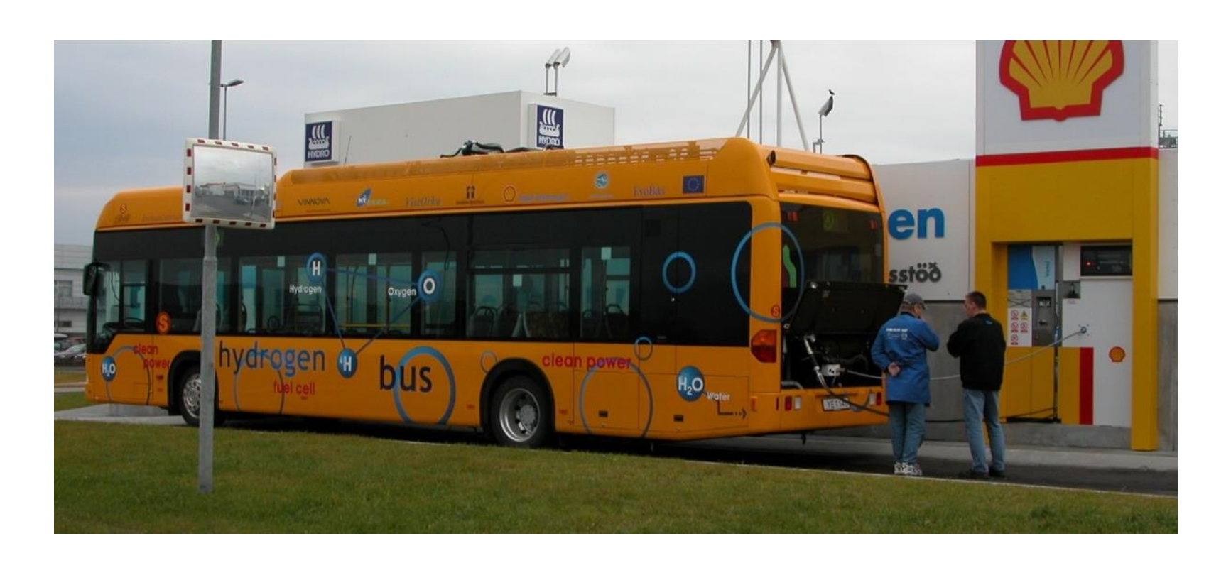
Frequent comment - _{"}H_{2} dont think so"