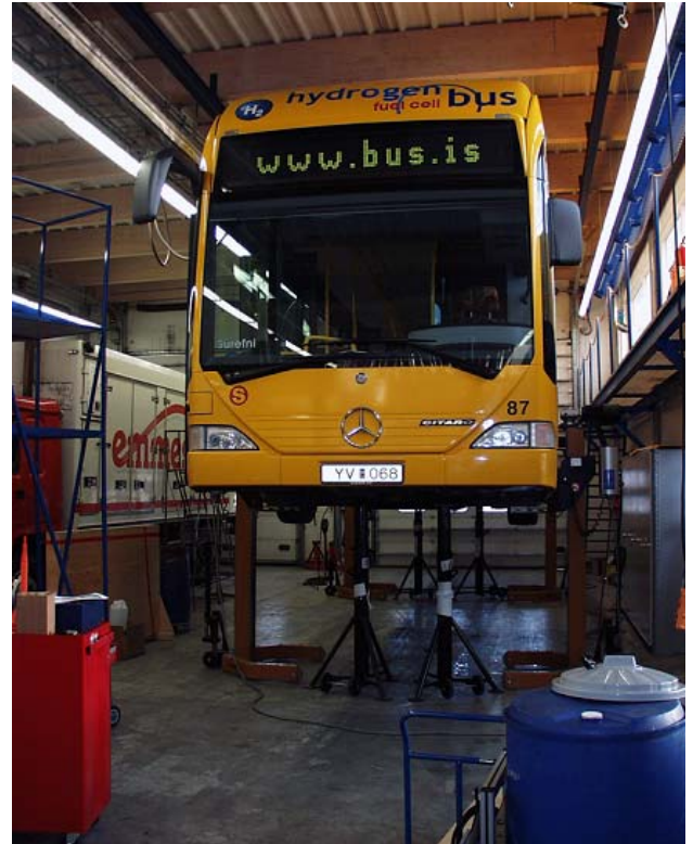
Two of the FC buses were dismantled and used in spare parts in other buses. The third went to a transport museum.

endurance tests completed. The information is of course integrated into the next generation of H 2 FC buses. The buses had been participating in HyFleet:Cute, a succession of ECTOS project.