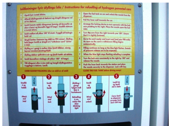
The instructions for users on how to refill your hydrogen vehicle.

As a preamble for the next demonstration steps the hydrogen station was reopened in Nov 2007 after thorough inspections and announced a licensed public hydrogen station. Then personal vehicles were introduced into the city traffic.