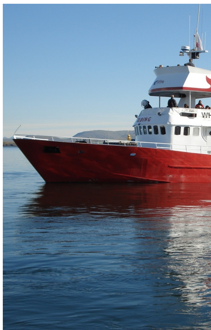
Elding the whale watching cruiser demonstrating a PEM-FC hydrogen auxiliary power unit.

cars, plug in battery cars and plug in motor and space heaters for internal combustion hybrid. Cars. The goal is to run them at least for 18 months and use various brands from Europe, USA and Japan. Introducing these 25 passenger vehicles in companies' service fleets means that the customer group will change and the service requirements will differ from those when only providing hydrogen for bus operators. INE/Shell Hydrogen will offer hydrogen on a price that makes the fuel costs for driving a fuel cell car comparable to the costs that incur while driving a gasoline car. Within the SMART-H 2 it is also intended to increase the availability of H 2 in Reykjavik by adding dispensing locations.