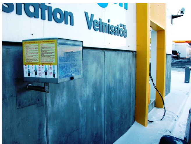
The hydrogen station with the card reader and surveillance camera

The hydrogen cars are used in service fleets and any member of staff at the municipality energy company and the national power company (Orkuveita Reykjavíkur and Landsvirkjun, respectively) can have training for operating the car and refuelling from the station and use the cars in their commute.