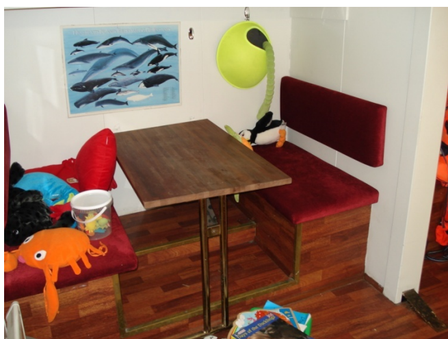
The space on board where the hydrogen Auxiliary Power unit is to be set up.

The Elding, a 125-ton, well equipped 150 passengers' cruiser and a stable ship, originally built in Iceland as a rescue vessel. The Elding will be used as a 'living laboratory' for the project; the prototype will be installed in real conditions and used to replace the current diesel auxiliary engine (which will still be onboard as back-up). The unit should generate electricity for all normal electricity demands of the boat.