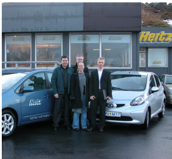
Hertz car rental in Iceland recieved a special award for its policy for offering lean fuel cars and hydrogen vehicles in their fleet.

In November, the 10 hydrogen hybrid Prius cars retrofitted by Quantum in California were also leased to the power companies, Orkuveita Reykjavíkur and Landsvirkjun, and the Hertz car rental service. The participation of Hertz means that for the first time in the world the public can rent and use hydrogen vehicles. That is a very important step towards the future as public acceptance is an important factor in the creation of a new energy paradigm.