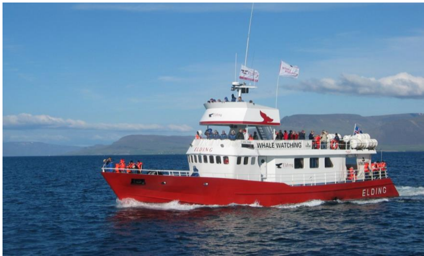
H 2 auxiliary system