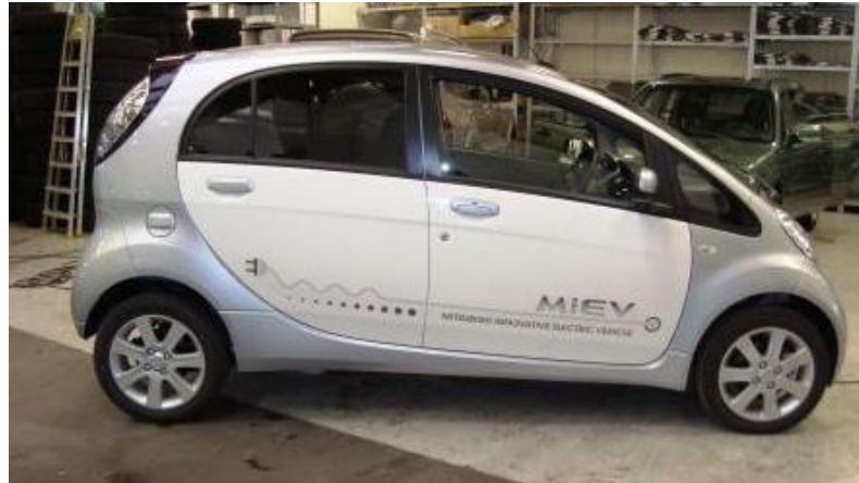
First iMiev outside of Japan

Frequent comment - „ no future in this “